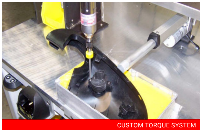
CUSTOM TORQUE SYSTEM

A great example is a custom system that was created for a manufacturer of automotive mirrors and vision systems. They needed equipment to ensure that screws securing a camera onto side-view mirrors were tightened to the proper torque. Our team created a semi-automated system to pass or fail mirrors based on screw torque to reduce the chance for human error.