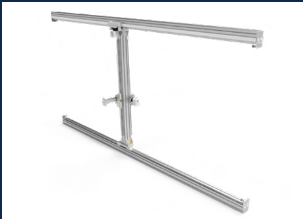
I-Form linear robots featuring ServoBelt™ Linear actuators excel at point-to-point motion control.

To ensure that Angstrom Designs' programmable LED solar simulators (pLEDs) perform successfully, they must be calibrated against solar cell standards called isotypes. We also designed a calibration system for the PPE solar simulator to test against, consisting of an I-format gantry that houses the solar cell isotypes. Known as the "Calibot," this I-frame gantry robot is capable of calibrating the pLEDs heads while the system is in either morphing position. When the Calibot is maneuvered to the pLEDs tester, control boxes are linked and docking mechanisms preserve the optimum standoff distance during calibration. Both the PPE simulator system and the calibot will be stored with NASA in the same facility.