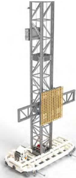
Fully constructed, the solar simulator tower reaches three stories. Here, the pantographic morphing array is shown in its six-by-six-foot configuration.

Because the simulator houses 240 of the 500-watt pLEDs heads, a large challenge of this project was managing over 120 kilowatts of power. Featuring many breakers and branches, the electrical system is designed to prevent overheating and fire damage should shorts occur at any level.