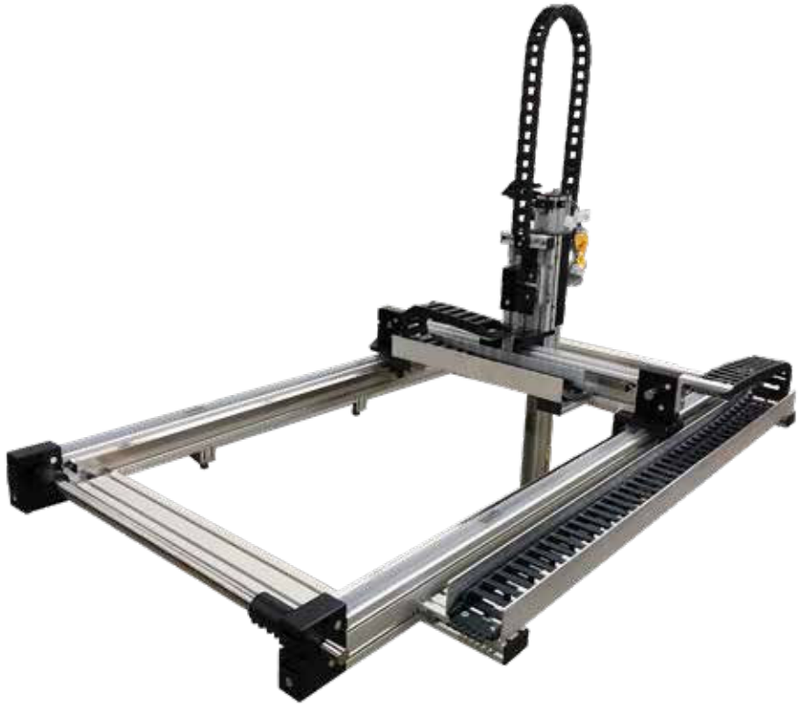
Figure 3: Gantry Solutions using AC Servos can be used for uncasing, loading or unloading.

Uncasing, loading, and unloading are applications that can be handled with a 6-axis robot or a servo controlled gantry mechanism