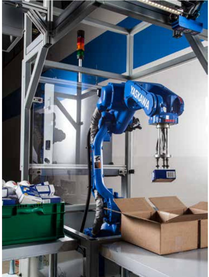
Figure 5: Picking Robot

The robot's ability to reach multiple locations, articulate the battery packs, and ultimately place them in the desired location makes it an ideal solution for this application