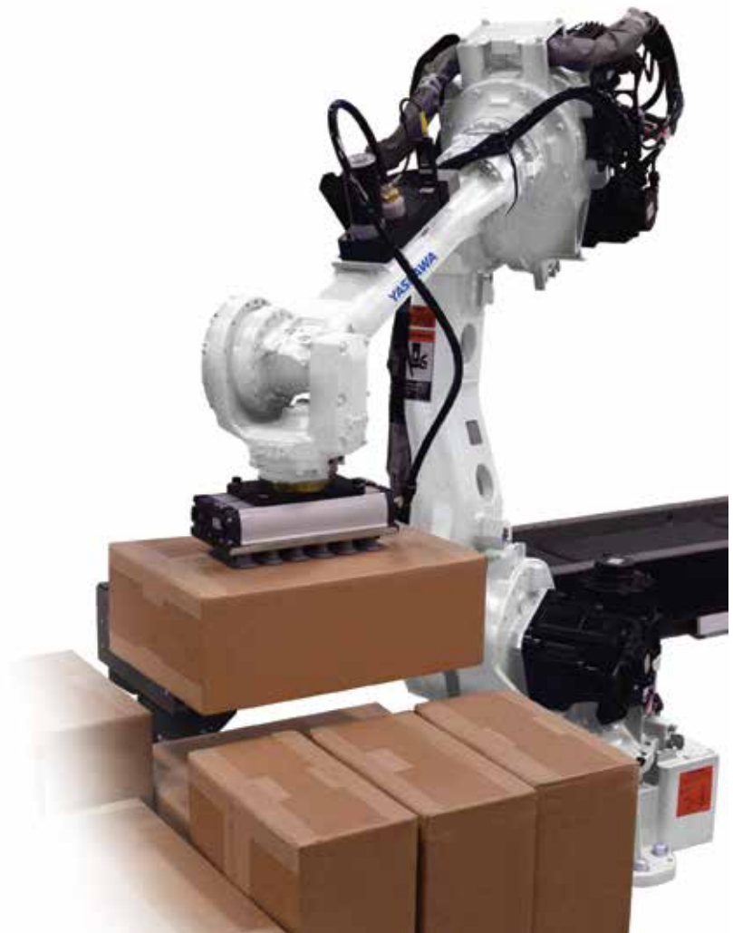
Figure 2: Robotic Depalletizing

A robot offers a balance of repeatability and flexibility to properly depalletize battery cells