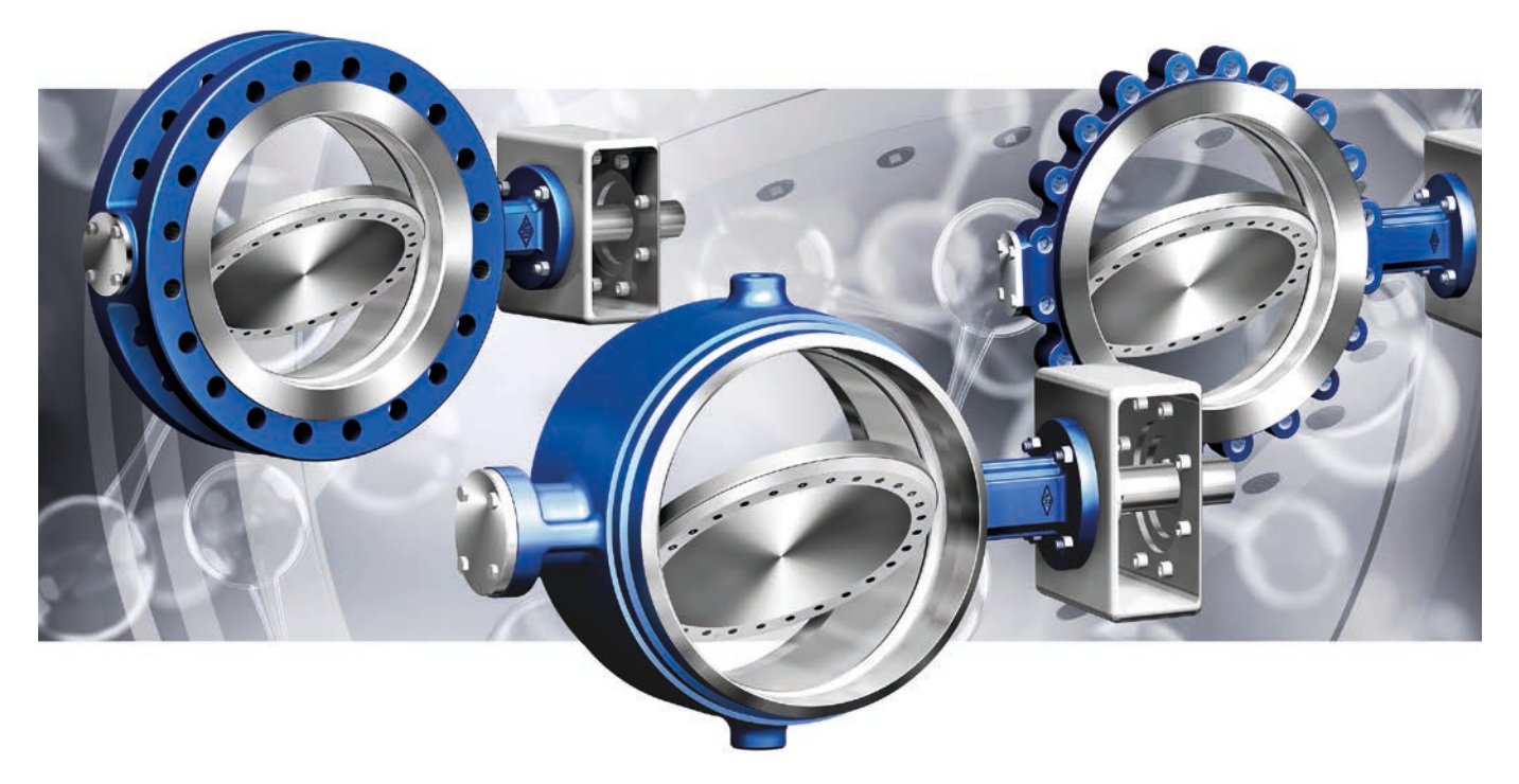
Fig. 3: ZETRIX triple offset process valve, shown here in double flanged, butt-weld end and lug type versions (from left to right).

ARI-Armaturen additionally offers a TA Luft packing with spring-loaded gland seal for various globe and quarter turn valves to ensure optimal external leak-tightness.