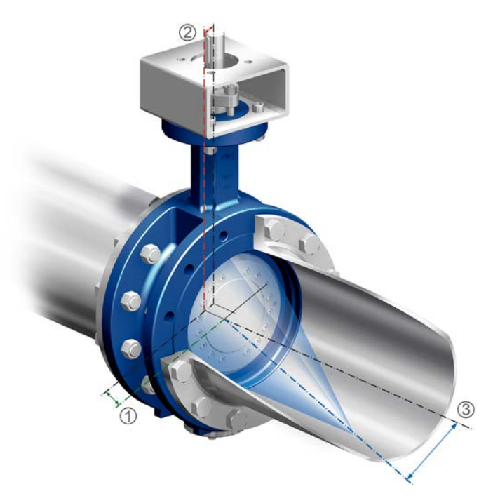
Fig. 4: Overview of the ZETRIX's three offsets.

When looking at the valve as a whole, it is important not to forget the bonnet seal. State-of-the-art graphite seals are used in standard and seals specially certified for hydrogen are optionally employed in consultation with customers. For the connection to the pipe and hence also for minimising emissions, ARI-Armaturen has a variety of solutions