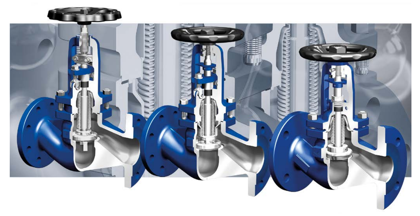
Fig. 2: Selection of stop valves with a bellows seal: the FABA-Supra C with two-piece stem and medium-flushed bellows (left), the FABA-Supra I with bellows cover (centre) and the FABA-Plus (right).

logies, on the other hand, can significantly reduce their climatedamaging emissions by capturing CO_2 and remain relevant for the market ramp-up of a hydrogen economy.