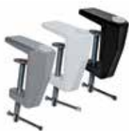
A-Edge Mount Bracket