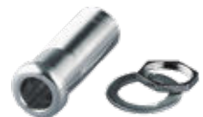
TE Table Bushing