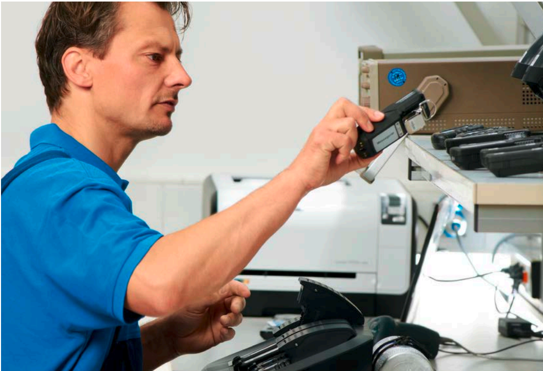
Much more convenient than manual exposure to gas: bump test at a test station.

»The problem with chlorine gas is that it quickly gets caught on device surfaces, on the diaphragm of a gas detector for example, on the bump test adapter or in the valves of a calibration station«, explains Ulf Ostermann, Sensor Expert at Dräger. The consequence: it simply takes much longer for the gas molecules to reach the sensor, regardless of whether a personal gas detector, clearance measurement or a functional test is used. In particular, chlorine molecules like to accumulate on the insides of hoses. As a result, many devices are not approved for chlorine clearance measurements.