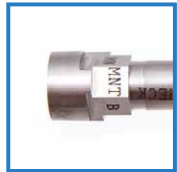
Plain (6) Step