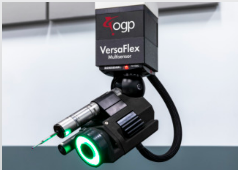
VersaFlex™ Articulating Sensor

FlexPoint is offered in three X,Z base configurations, each with a choice of Y-axis range to suit a wide variety of manufacturing needs.