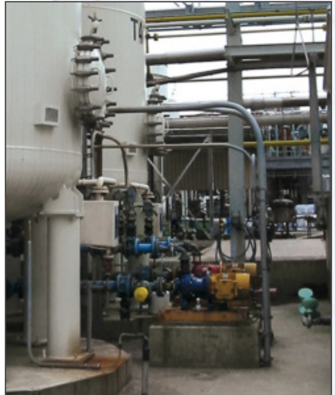
Figure 1: FCI Model FLT93S flow/level switch protects pumps from dry-running and other operational downtime conditions

Liquid and gas additives are frequently injected into processes, including, for example, oil well heads, mercaptan into natural