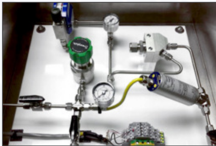
Figure 3: FCI Model FS10A in a typical sampling system

Flue gases are the general name given to the mixed composition gases that are the by-product of a combustion process. A flue is typically a large pipe, duct, stack, chimney or other venting attached to a process system such as a boiler, furnace, steam generator, oven, etc., through which waste flue gases are exhausted from the combustion process.