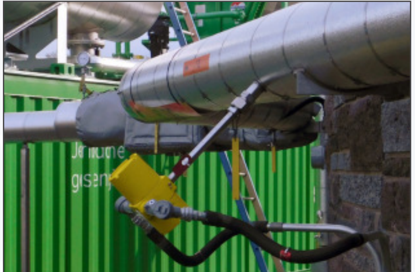
Figure 4: Consider meter flow straight-run requirements and flow disturbers

Or, is your process tied to a bus communications based control network requiring HART, Modbus, Foundation Fieldbus, Profibus, BACnet, EtherNet/IP or other protocol?