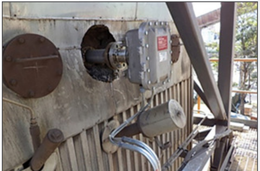
Figure 3B, bottom: Extreme example of very large diameter pipe, high temperature insulation, dusty, outdoor, above ground installation point, and in Div.1/Zone 1 type Ex location that were made clear at the beginning to ensure first time right success.

Will the installation be in a round pipe or a rectangular duct? What is the diameter, both OD and ID, of the pipe or dimensions of the duct? If an insertion style meter, what is the dimension of the socket (e.g. thread-o-let) and will it be installed through a ball valve? These are important considerations for three reasons: 1) Smaller diameter pipes require use of an inline or spool-piece design rather than an insertion type; 2) If an insertion-type, whether a single-point or multi-point averaging solution is recommended; and 3) to ensure the probe length is correct to achieve the proper insertion depth into the pipe (In single point types, the center of the pipe is the required installation depth.) (Figure 3/3B).