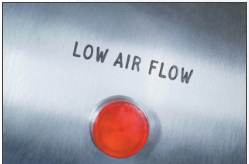
Figure 2: Know your flow range