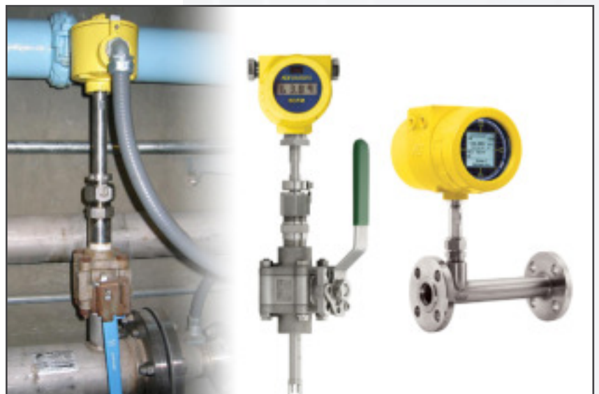
Figure 6: What is the required mechanical connection to pipe?