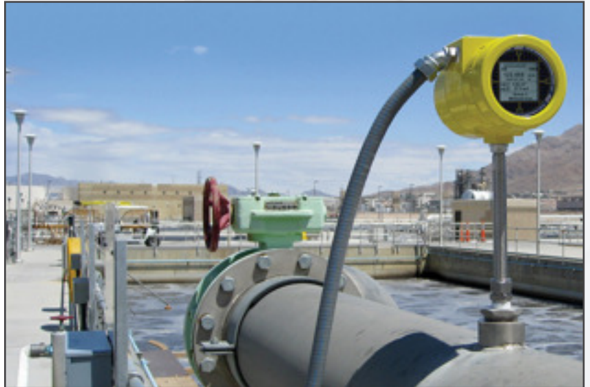
Figure 5: In outdoor, harsh desert sunlight, know the ambient conditions of your installation location

Often overlooked during initial considerations and application suitability are requirements for certifications and qualifications beyond the basic meter performance. This might include such things as pressure tests, certified materials and traceability, positive material identification report, and/or welding pedigree and certificates. If the thermal flow meter is to be used in a safety instrumented system (SIS), is there proof, and preferably independent verification, of SIL compliance (Fig. 7)? If the flow meter will be used in emissions monitoring (CEMS), does it need to have special functions or features added (e.g. calibration check routines) to comply with local regulations (e.g. US EPA, European QAL1, etc.)?