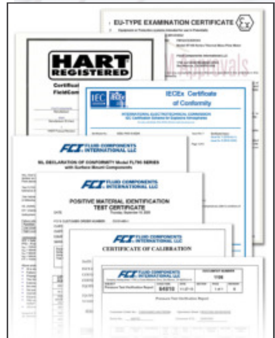
Figure 7: What certification requirements need to be met?