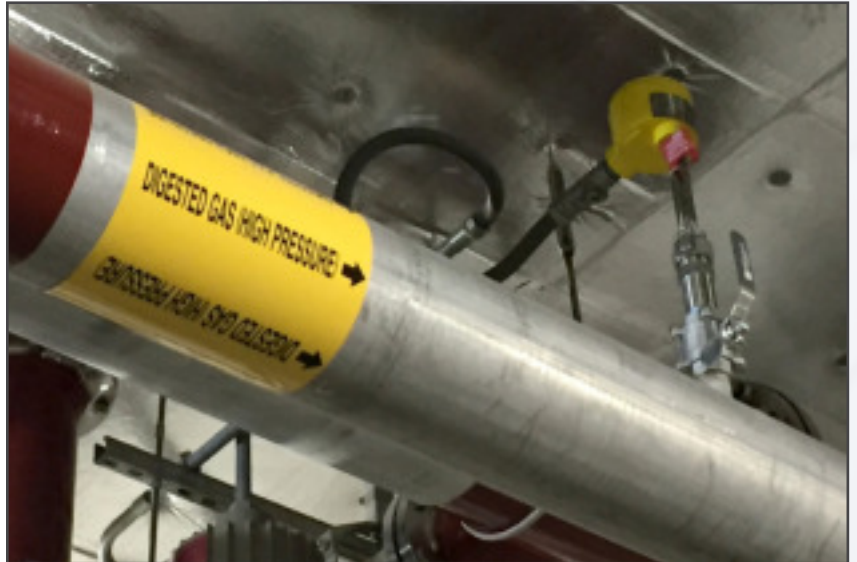
Figure 1: Knowing gas type is required to specify a thermal flow meter

One of the compelling features of thermal flow meters is their wide turndown capability