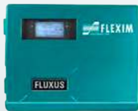
FLUXUS® G721 ST

More than 25 years of experience in non-invasive ultrasonic flow measurement