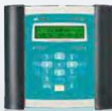
FLUXUS® G601 ST