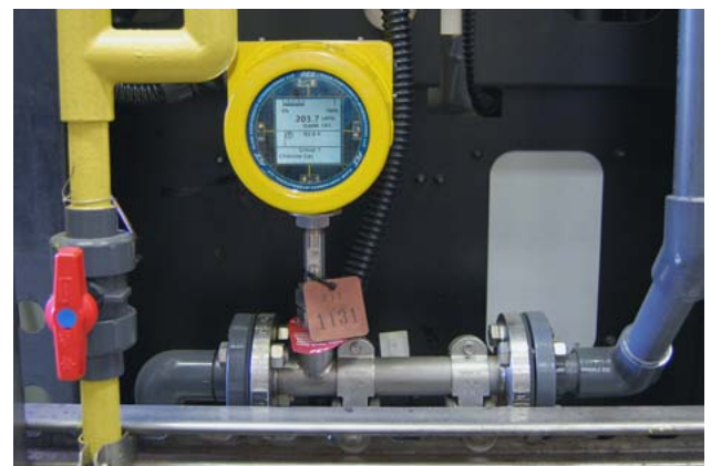
Figure 2: Installed ST100L Flow Meter with Vortab Flow Conditioner

The treatment plant needed a better gas flow meter solution that would be appropriate for service in a 1-inch diameter pipe at a flow rate of 150 lb/day to 2,000 lb/day [68 kg/day to 907 kg/day]. The operating temperature was 60 °F to 100 °F [16 °C to 38 °C] at a pressure of 0 psig to 10 psig [0 bar(g) to 0.7 bar(g)]. The flow meter would be used to measure chlorine and no other gases and would be installed in a location where inadequate straight-pipe run was present and added to the accuracy challenge for any velocity based instrument. The flow velocities also resulted in measurement required in the transitional zone where the gas flow profile was transitioning from laminar to turbulent. Mass flow provided an additional advantage of allowing a simple, direct means of reconciling monthly throughput compared against the change in weight of the chlorine gas containers that were installed on load cell technology scales.