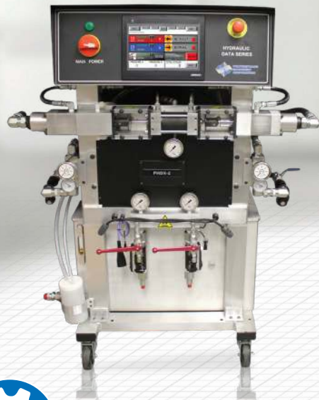
Smart Machine PHD/PHDX-2 Series

Data and production control using the NX1 designed to fit PMC's space constrained control panels.