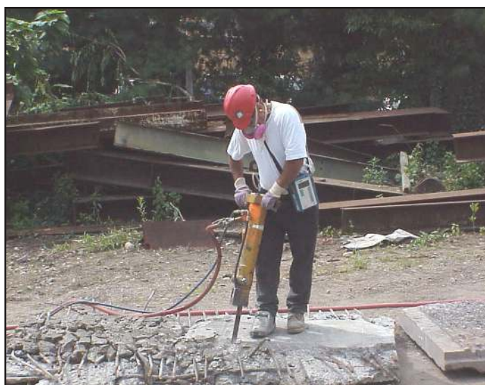
A worker chips concrete with a jackhammer using a water-spray attachment to control dust. (Photo courtesy of NIOSH).

Use ground-fault circuit interrupters (GFCIs) and watertight, sealable electrical connectors for electric tools and equipment on construction sites. These features are particularly important in wet or damp areas, such as where water is used to control dust.