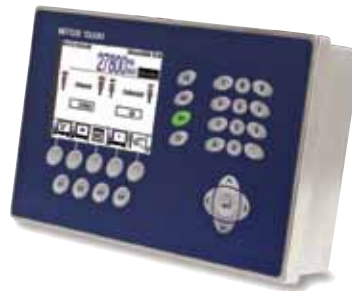
Optional IND780 scale terminal