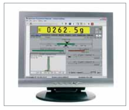
Sartorius ProControl@Remote user interface