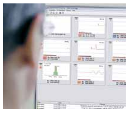
Data display directly from the process on your

are new software packages that enable you to seamlessly control and manage any number of SYNUS® and or CoSYNUS devices in network operation via a PC. The user interface and the ability to save and document data meet the highest specifications of both users and lawmakers. These software packages can be used individually or combined. Together, they represent a comprehensive solution for efficient time and cost-saving monitoring and control.